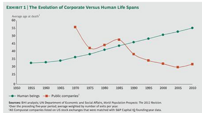
Figure 3: Evolution average lifespans of companies and individuals

compare figure 3 (Reeves and Pueschel, 2015). The increasing importance of ICT is an important factor in this respect (Bartelsman 2013). This inverted scissor movement in lifespans undermines any initiative to provide guarantees to employees' pensions.