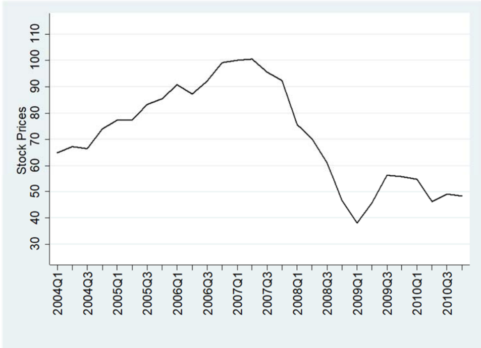
Notes: 2007 Q1 = 100.