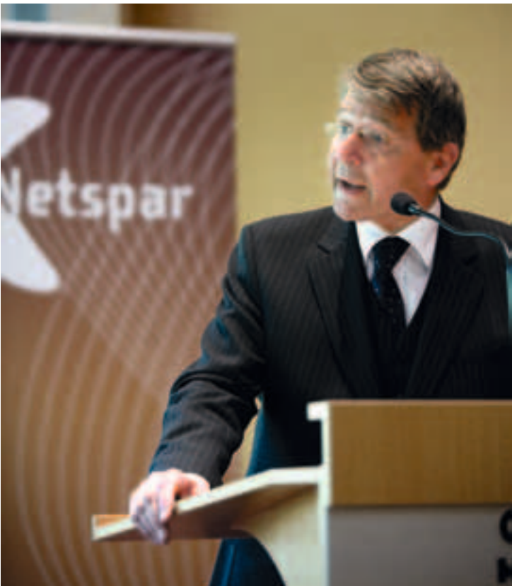
Piet-Hein Donner, Dutch Minister of Social Affairs and Employability, at the Netspar Annual Conference

More information to follow on our website.