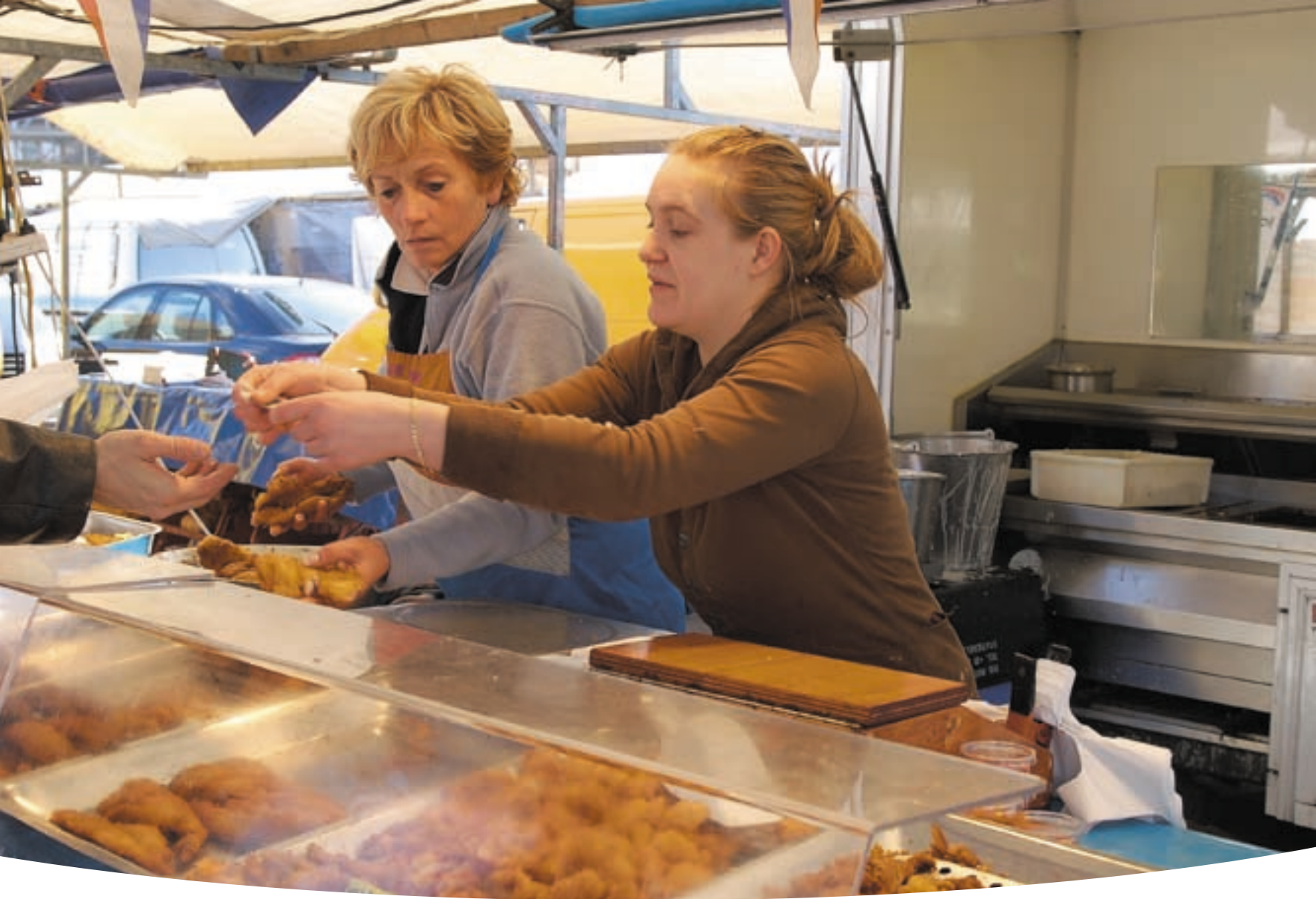
The demand for female human capital increases.

various activities are combined over the life course contains the main opportunity cost of becoming a parent: foregone career possibilities. In this way, people can exploit their longer life to combine the pursuit of a fulfilling career in paid work with the vital task of rearing the next generation of workers.