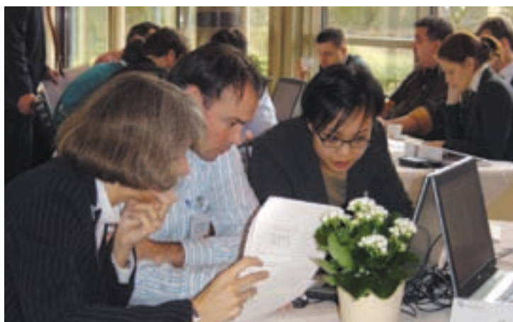
Participants at work in case study on responsible investing, May 2008.

In the near European future there will be an excess of retirees and a shortage of people of working age. If the social security system continues on the old footing, collective insurance of old-age risks will soon be unaffordable. This gloomy scenario forces policymakers to rethink their policies, and pension reform is one of the key tools that can be used to prepare our society for the future. The European perspective of aging will be the central theme in the new three-day module of the Netspar-UMBS Academy, targeted at executives of the pension and insurance sector. In a challenging and interactive setting, this module brings together high-level economists who will discuss several topics of pension reform. In addition to receiving the latest insights, participants will also be offered a computer model with which they can run simulations on policy reform.