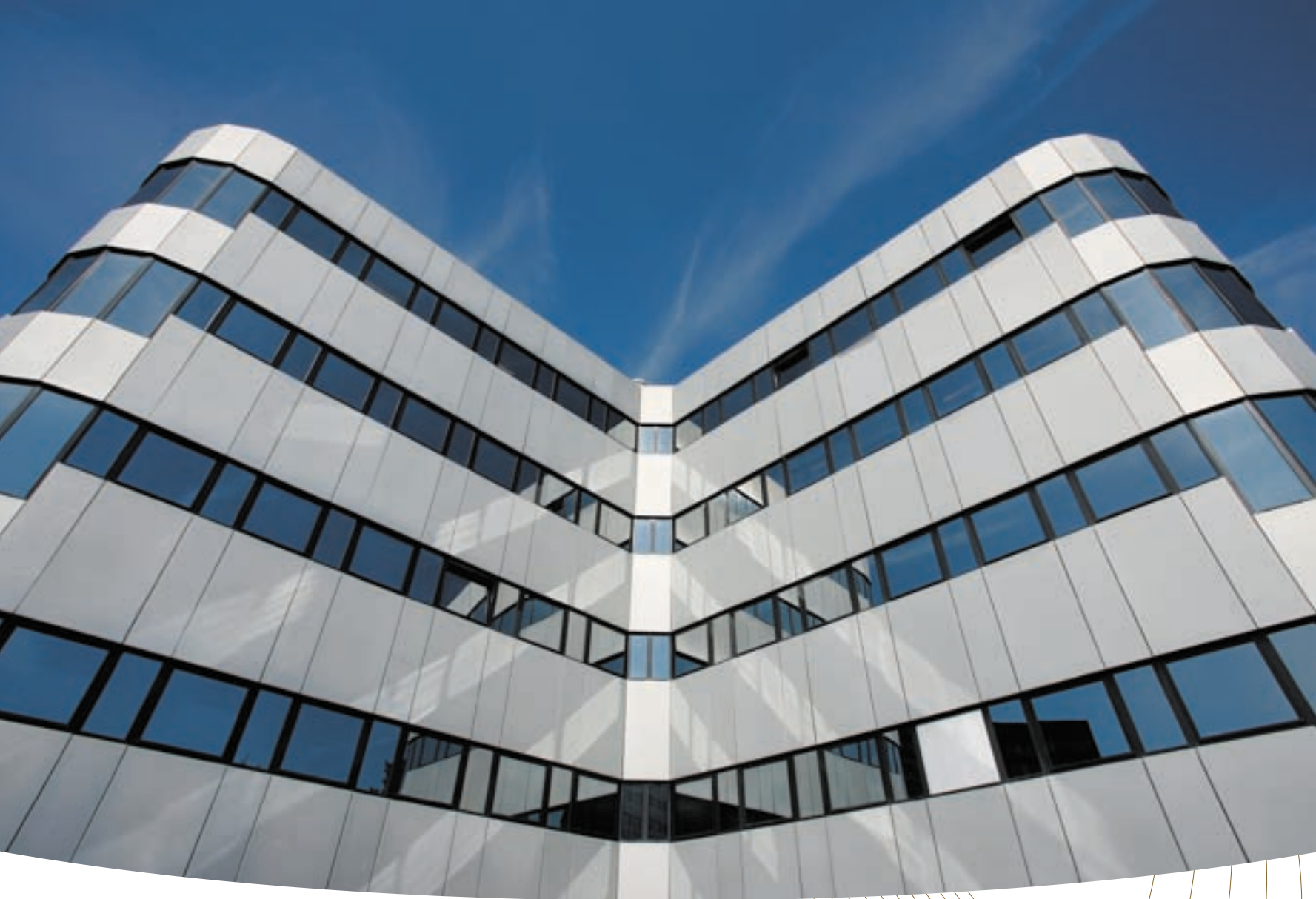
Mn Services' headquarters in Rijswijk